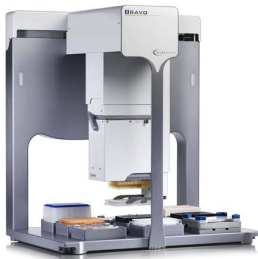
The Bravo has nine deck positions and can be configured with interchangeable 8-, 16-, 96-, or 384- fixed and disposable tip heads.

This technical note describes a method to measure the accuracy and precision of the Bravo in