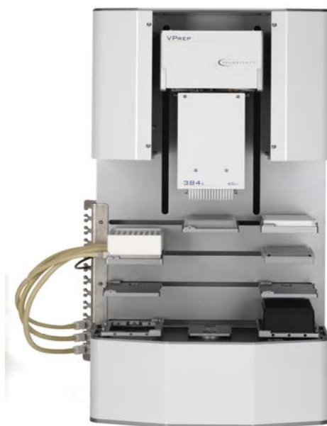
The VPrep has eight deck positions and can be configured with interchangeable 8-, 16-, 96-, or 384- fixed and disposable tip heads.

This technical note describes a method to measure the accuracy and precision of the VPrep in conjunction with a 96 Channel ST Disposable Tip Head. The 30 µL disposable tips were