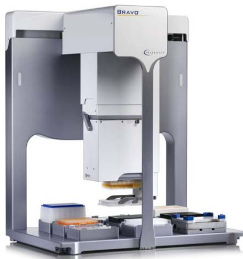
The Bravo has nine deck positions and can be configured with interchangeable 8-, 16-, 96-, or 384- fixed and disposable tip heads.

This technical note describes a method to measure the accuracy and precision of the Bravo in